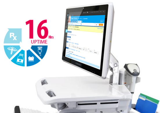
Hot Swap Batteries allow for up to 16 hours of up time without plugging into a power source.

Medical grade hardware manufacturers use very high grade discrete components (capacitors, resistors, transistors, diodes, etc.) in its manufacturing of motherboards and PCBs; all are designed to last 5+ years and provide a strong MTBF (Mean Time Between Failures) of 50,000+ hours. However, other Tier 1 manufacturers use standard commercial grade discrete components that have a much lower MTBF. Medical grade computers are designed for the reliability needed to sustain 24/7 hospital operations, and reduce the time and cost of routine maintenance. That's why reliability is an important part of the "medical grade" definition. The use of industrial and military grade components also results in a much lower failure rate for medical grade computers compared to their Tier-1 counterparts.